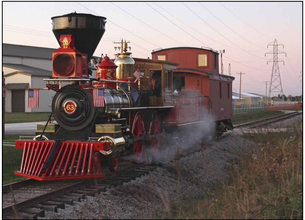
Above: In a huff of steam” the “Leviathan” departs Nelson Crossing enroute to Monticello. Below: “Pride on our rails”