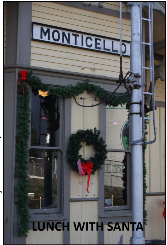
LUNCH WITH SANTA