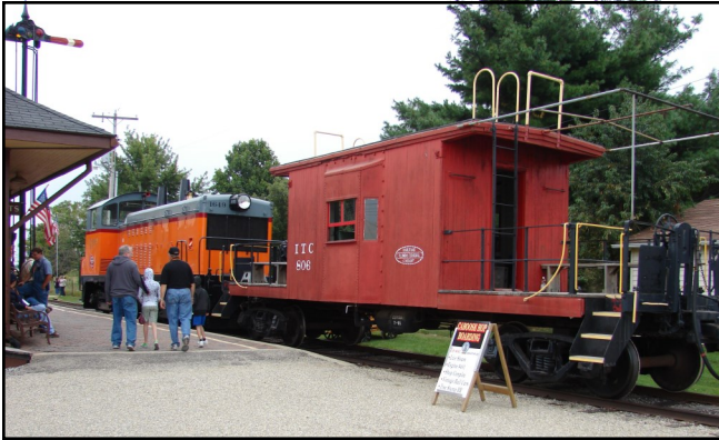
Above; The "Caboose Hop" operated between Nelson Crossing and Camp Creek Yard.