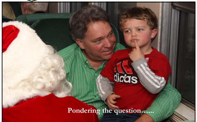
Pondering the question.....