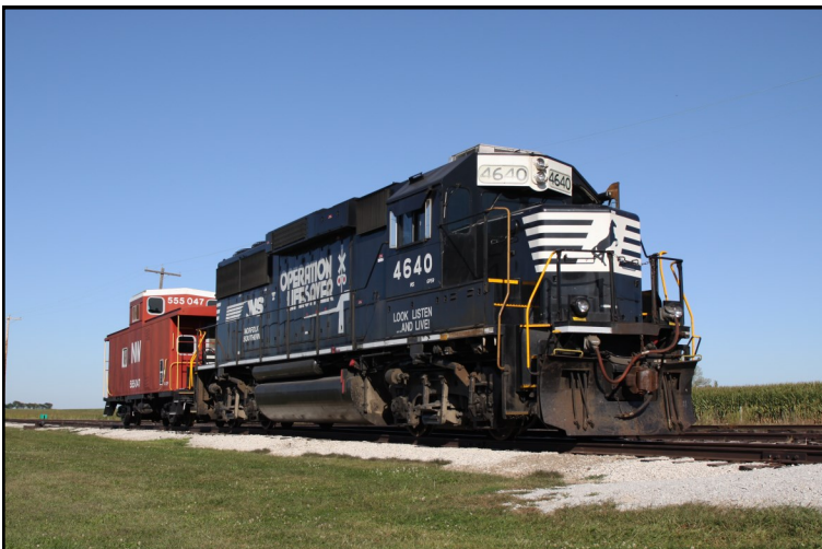
The Norfolk Southern Operation Lifesaver Locomotive and OLS display were part of the event.