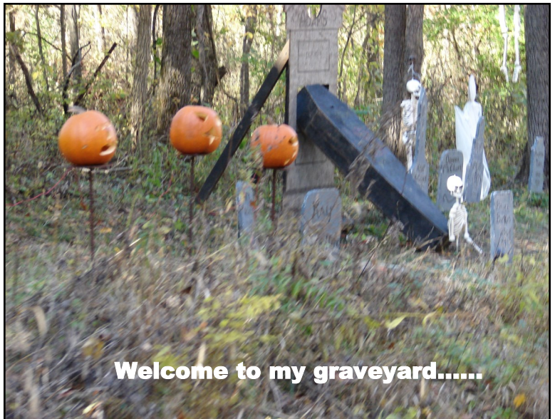
Welcome to my graveyard.....