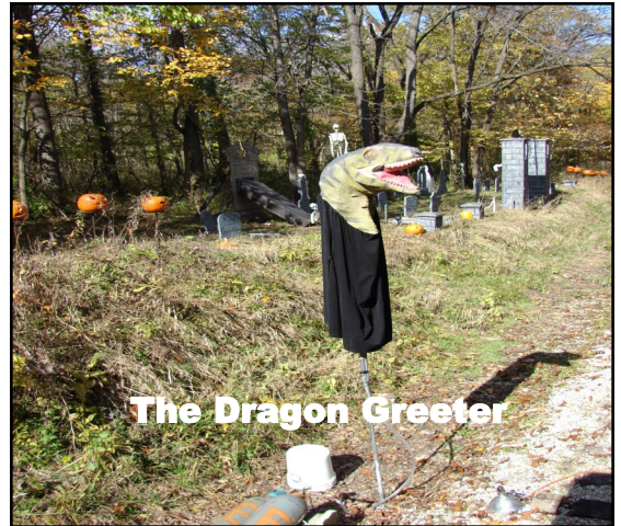
The Dragon Greeter