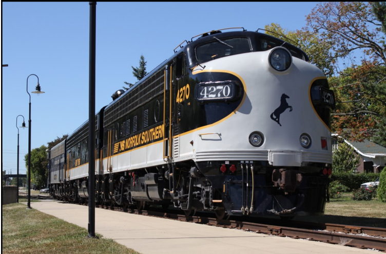
As part of the exhibition, the Norfolk Southern Executive Train units were on display at the Depot and Yards