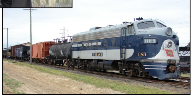
Above; The passenger run consisting of Illinois Central equipment arrived Monticello Depot. Right: The mixed freight with Wabash on the point prepares to depart Nelson Crossing.