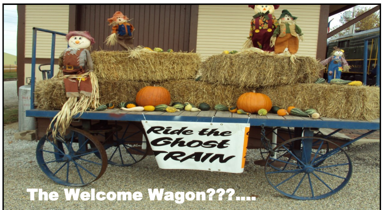
The Welcome Wagon???....