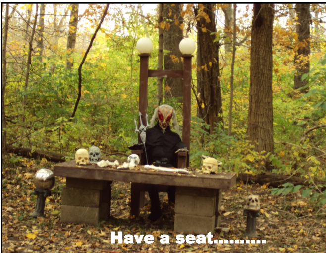
Have a seat.....