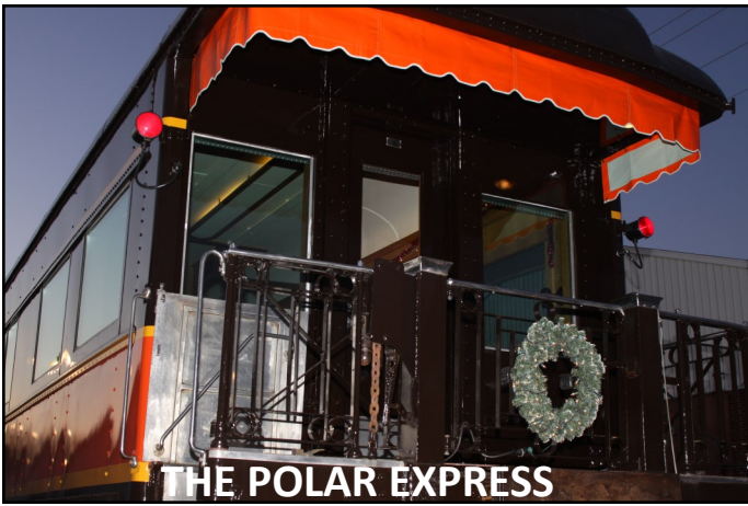
THE POLAR EXPRESS

The Polar Express once again ascended onto the rails of the MRM on November 27th- 28th and December 4th and 5th, filling each car with eager faces looking forward to meeting Santa. On December 4th-5th the young believers of Santa were aboard to share lunch with the jolly elf.