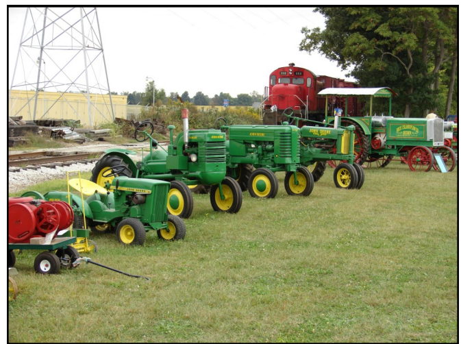
A collection of John Deere antique tractors were on display.