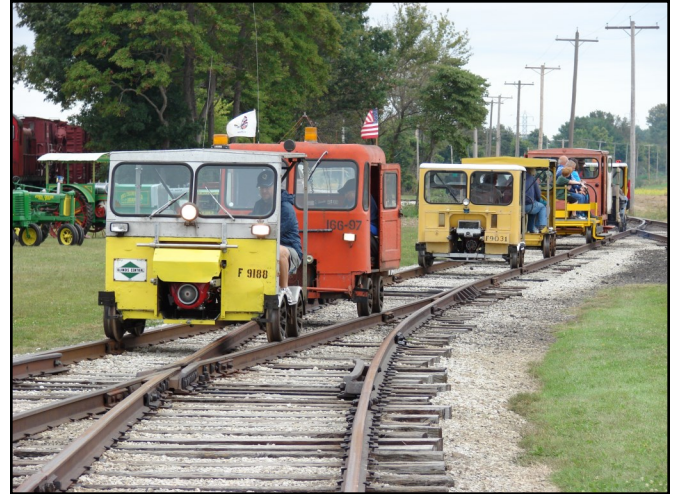
A parade of motorcars are returning to Nelson Crossing from a trip to County Road.