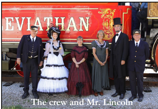
The crew and Mr. Lincoln