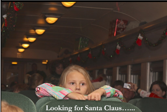
Looking for Santa Claus.....