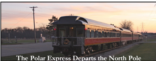
The Polar Express Departs the North Pole