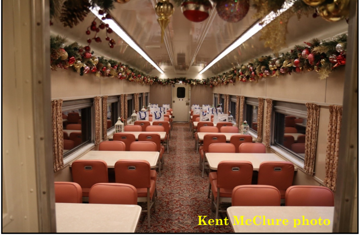
ABOVE LEFT: New carpet for IC diners 4110 and 4112. This carpet was custom-made for MRM, to match original carpet in pattern and colors. Photo was taken just before cutting to the length and width need to install in 4110. ABOVE RIGHT: The new carpet installed in IC 4110, and the car partially decorated for Polar Express. The seats shown are also freshly re-upholstered, and the drapes shown are original to the car.

IC Diner #4110 A second refrigerator was placed in service in this car this early summer, and so far appears to be working well. We still need to do a thorough cleaning in the refrigerators of this car, and we're also working on a third refrigerator in this car, this being the refrigerator in the kitchen. We are also working with a firm in the east that specializes in recreating fabrics, in this case for making new curtains to closely match the originals, of which we are missing three. We are still awaiting a quote on this project.