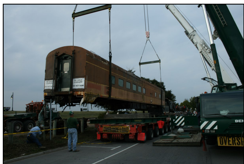
Diner ICRR 4112 is being lifted off its trucks and onto a trailer for movement between LASM and CN Yard .

overnight. Monday's work started with the removal of a broken exterior window pane, inspection of axle roller bearings, including draining and re-filling journal boxes with fresh lubricant, removal of the locking center pins (unlike on freight cars, passenger cars have a locking center pin to prevent the truck from separating from the car during a derailment), installing locks in the car doors on each end so it could be secured during transit, and installing the renewed truck air brake cylinders and the main air brake valves, which we had transported with us. Tuesday's work started off with renting an air compressor with a large enough capacity to test that the renewed air brake system would perform properly. Over a half dozen air brake hoses required replacement due to age with two of the hose connections being next to impossible to get a wrench on. The