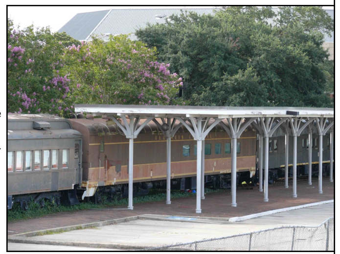
ICRR Diner 4112 as it appears under shed at the Louisiana Arts & Science Museum in 2007.

Sunday's work included disassembly of the truck air brake cylinders for renewal, removing the over 300 feet of the LASM electrical supply conduits from the underframe of the car and removal of the HVAC equipment from the interior. The weather on Monday was only about 45 degrees and cloudy, but the rain had