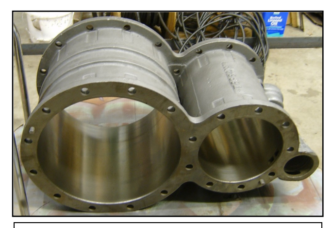
Air cylinders after boring and honing

brakes on the train and locomotive and to operate the sanders and bell ringer.