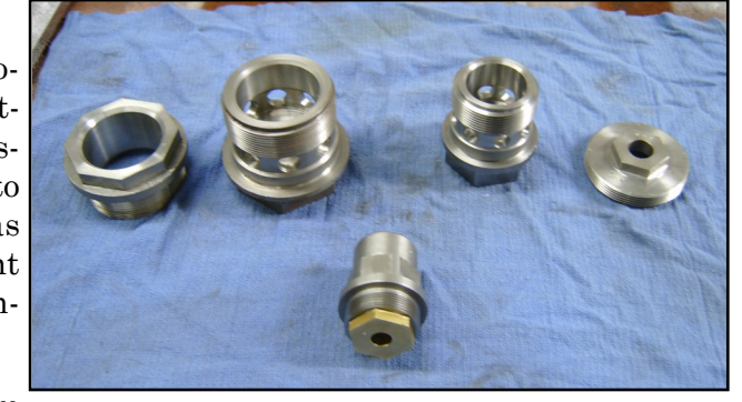
Check valve seats and other parts we made in our shops at the museum.

Last, the upper steam head was installed and the steam portion leak tested in the same way. The final in-shop test was to run the pump on compressed air to see that everything was functioning properly.