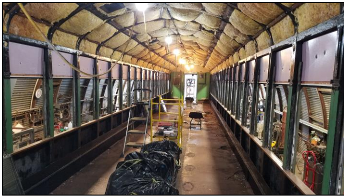
REHABILITATION OF SNOW PLOW CONTIUNES