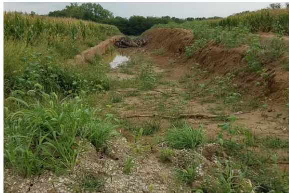
An eighteen-inch diameter drainage pipe has been installed from the area of the proposed roundhouse, eastward across the field to a tributary that drains into Camp Creek. A deep cut had to be made across the field.