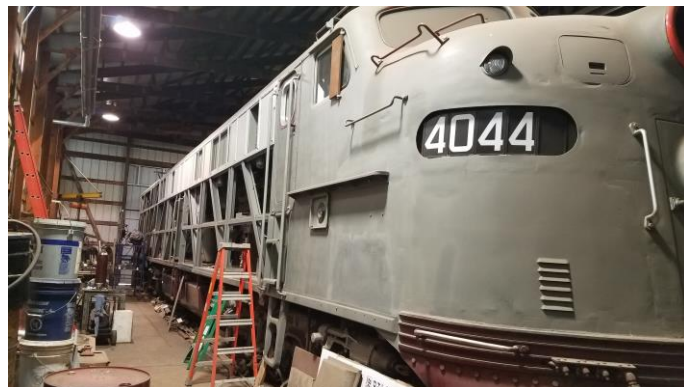
Side body panels are being installed on the engineer side of the unit and a brand new Mars light has been installed.