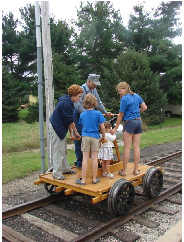
Visitors Pumping The Hand Pump Car