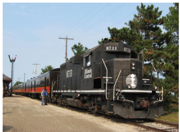
A Train In Full Illinois Central Regale