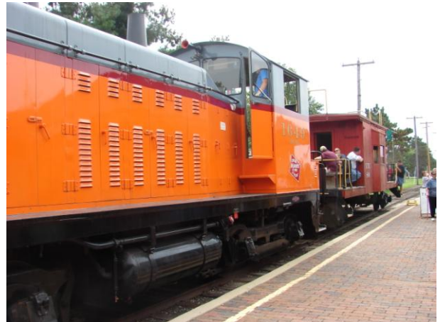
The Yard Hop