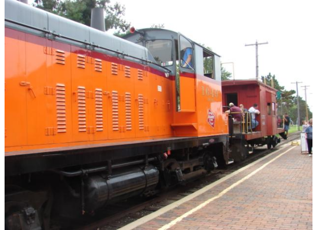
The Yard Hop