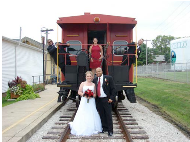
The newlyweds could not have found a better background for posing for their wedding pictures!!