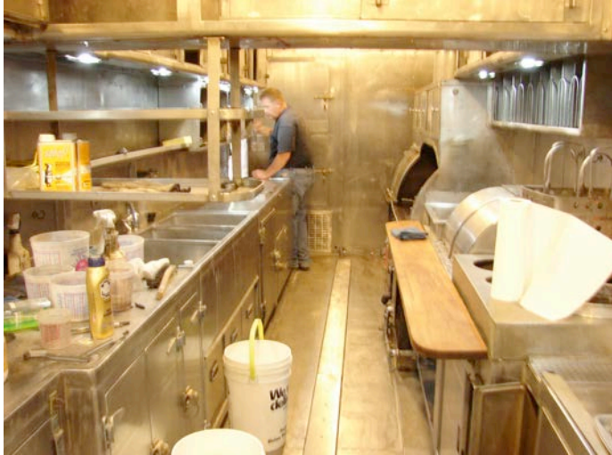
Above: The galley (kitchen) area has been cleaned and restored for service. Below: The coal/wood-fired cooking stove to right and the steak grill (lid closed) to the left.

"NOTHIN' FINER THAN DINNER IN A DINER..." 🎵